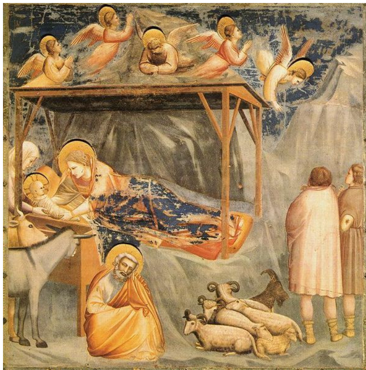
Giotto, Natività di Gesù – Cappella degli Scrovegni, Padova

O magnum mysterium et admirabile sacramentum ut animalia viderent Dominum natum iacentem in praeseptio.